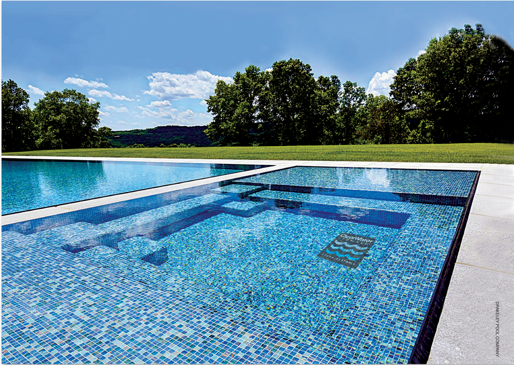
DRAKELEY POOL COMPANY