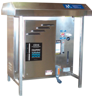
APEX A4 e Ozone System