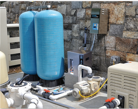
APEX VII Residential Installation